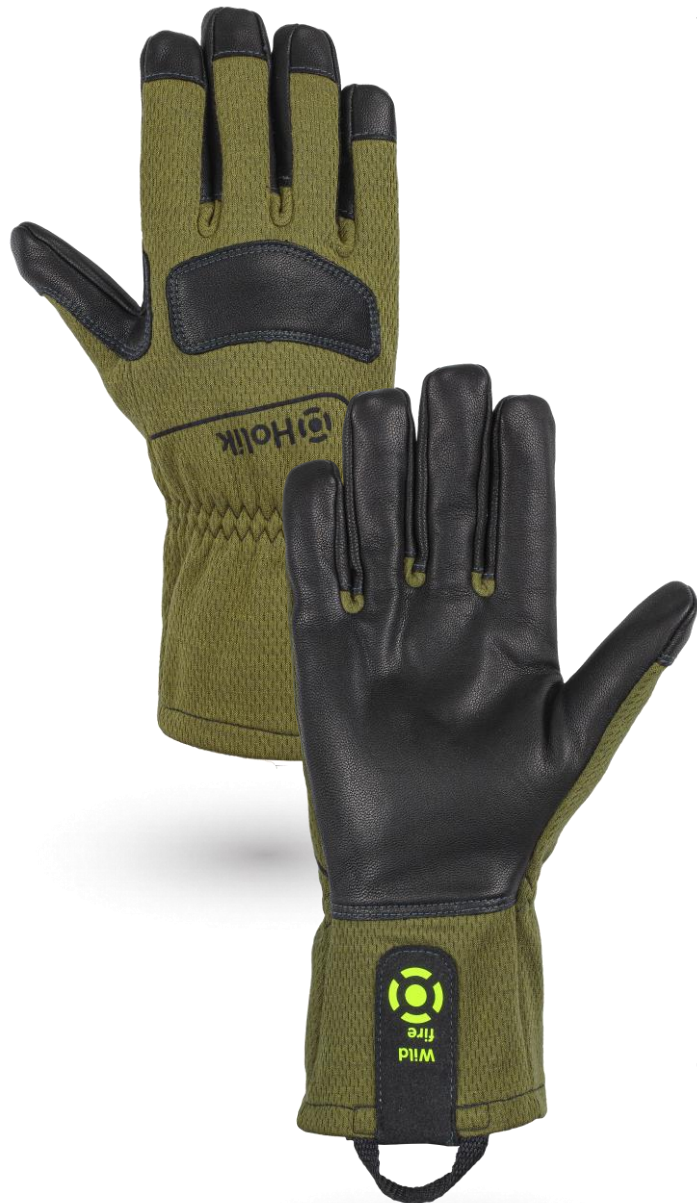
FORESTA II 8270 Long Coyote

FORESTA II gloves are specially designed for forest fires and are characterized by their high breathability, sensitivity and protective properties.